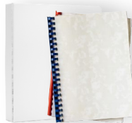
Spiral bound reports Full 3-ring binders Confidential paper