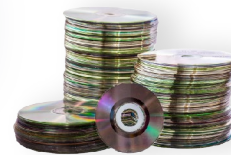
CDs, DVDs, VHS Confidential Media