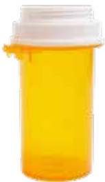
Plastic Amber Pill Bottles