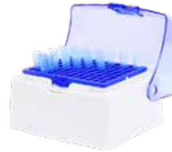
Pipette Tip Boxes