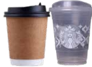
Plastic & Paper Cups