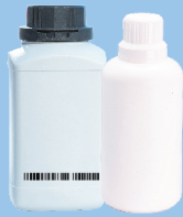
Plastic reagent bottles