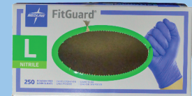
Glove & Tissue boxes (empty)

Flyers & Brochures Paper bags White paper Colored paper Envelopes File folders Magazines Junk mail Paper & Plastic cups Plastic containers Glass bottles & jugs