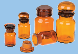
Amber glass bottles