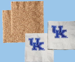
Paper towels and napkins