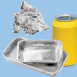
Aluminum: Cans, pans, and foil.