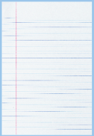
Mixed paper: programs, flyers, pamphlets, sticky notes, paperboard