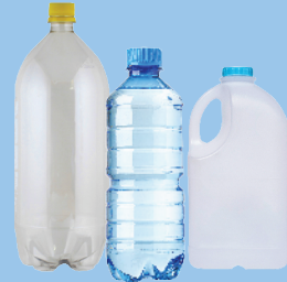
Plastic screwtop bottles and jugs