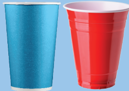
Paper and Plastic Cups