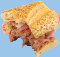
Food and Liquids