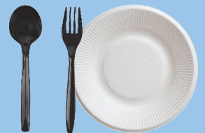
Disposable cutlery and dishes